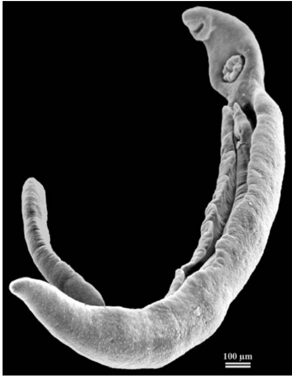
Figure 12.1 A schistosome pair, with the thin female located in the male gynaecophorical canal. (From Beltran et al. 3 )

is exclusively a female option 3 . They feed on blood and on globins within the plasma, regurgitating indigestible remnants back into the bloodstream. Once lodged in place, the adults live for an average of 3–5 years, although survival for three decades has been recorded.