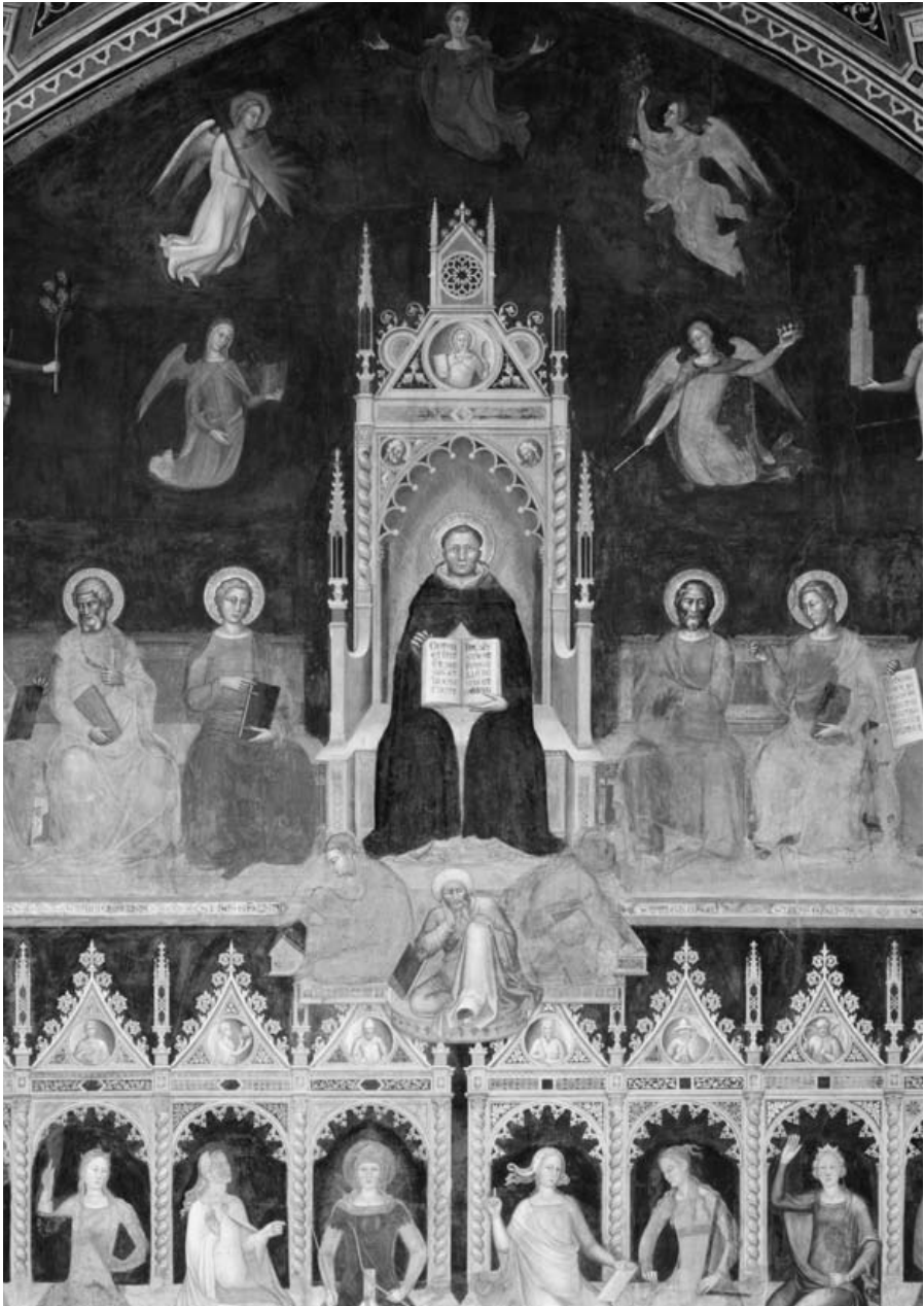
The fresco Triumph of St Thomas and Allegory of the Sciences in the Church of Santa Maria Novella in Florence, by the Florentine painter Andrea da Firenze (Andrea Bonaiuti; flourished between 1343-1377). Ibn Rushd is depicted with two other 'defeated heretics', Sabellius and Arius, sitting at the feet of Thomas Aquinas (c. 1224-1274).