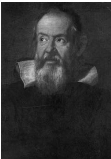
Galileo Galilei (1564-1642), Italian physicist, mathematician, astronomer, and philosopher. The ‘Galileo Affair’ came to represent the paradigm case of religion-science conflict.

Galileo’s astronomical discoveries in the years 1609-1612 lent a new urgency to the whole affair. They seriously challenged the Aristotelian world-