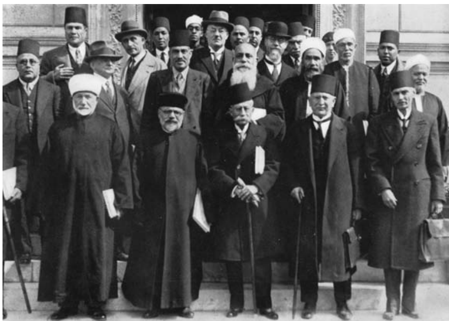
Members of the Royal Arabic Language Academy in Cairo, Egypt, a few years after the dismissal of A.J. Wensinck (1936).

The Royal Arabic Language Academy was established as subordinate to the Ministry of Education. Its primary aim was to preserve the integrity of the Arabic language, and to match it with the modern demands of sciences and arts. The academy was also expected to compile a historical dictionary of the Arabic language, organize academic studies of modern Arabic dialects and explore all possible means for the advancement of Arabic. 27