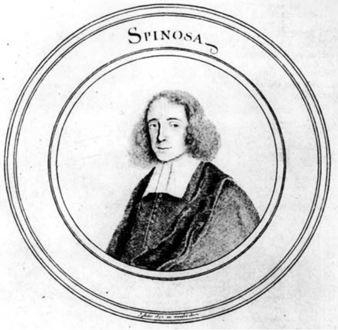
Baruch de Spinoza (1632-1677), Jewish philosopher. In his Tractatus Theologico-politicus (1670) Spinoza presents a political plea for freedom of thought and freedom of religion.

Scripture, including a critique of current views on the authority of Scripture. Furthermore, the treatise discusses misconceptions and prejudices in religion, and the role of political and religious authorities. To Spinoza, freedom of thought is primarily the freedom to think according to the rules and principles of reason, without being guided or hindered by other rules and principles, and above all without being hindered by clerical dignitaries. In the time of Spinoza, quite a number of religious dignitaries and ministers strongly opposed freedom of thought. Their opposition included an appeal to the sacred writings of their tradition. In order to counter these arguments, the Tractatus includes a discussion of the nature of philosophy, the nature of religion and superstition, the authority of Scripture and the related themes of revelation, miracles, election, etc.