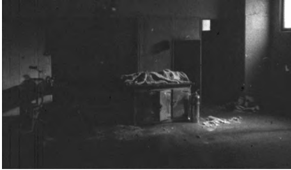
Figure 6.1 Loft (Kurosawa Kiyoshi, 2006)

practice of embalming: “To preserve, artificially, his bodily appearance is to snatch it from the flow of time, to stow it away neatly, so to speak, in the hold of life. It was natural, therefore, to keep up appearances in the face of the reality of death by preserving flesh and bone.” 18 The photographic medium, particularly film, came to fulfill this human desire to halt the passage of time: “The film is no longer content to preserve the object, enshrouded as it were in an instant, as the bodies of insects are preserved intact, out of the distant past, in amber. The film delivers baroque art from its convulsive catalepsy. Now, for the first time, the image of things is likewise the image of their duration, change mummified as it were” (15). I am sure Kurosawa had this passage in mind when conceiving this film. Indeed, Kurosawa reveals his Bazinian profile in explaining his preference for long takes: “Regardless of how conscious Louis Lumière was, film is, in principle, completely different from moved photographs [ ugoku shashin , such as Thomas Alba Edison’s Kinetoscope, in Kurosawa’s theory]. Film is a medium that records both time and space and thereby conveys the fact that that was certainly there.” 19