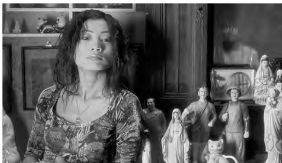
Figure 8.3 Auntie Mei and her emporium of kitsch

unfinished business. But the revelation brings a chill. Next to a photo from the past exposes a different truth: Mei is a ghost in a gorgeous shell.