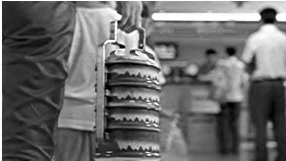
Figure 8.2 The opening shot of Dumplings : Auntie Mei and her lunch box at the customs between Hong Kong and the Mainland

Dumplings opens as Mei crosses the China/Hong Kong border to return to her home in Hong Kong. Mei, like many mainland immigrants, crosses the border daily to make a living (northbound colonization). She is a good-looking woman. With trendy attire revealing her curvaceous body, heavy makeup, high heel shoes, Mei's image fits the stereotype of Chinese sex workers as depicted in Fruit Chan's "China Trilogy." But she is not. She tells the customs officer that she is delivering lunch to her children studying at Hong Kong schools. She is right; there are homemade eggs and ham inside her old-fashioned lunch box. The old red Chinese lunch box helps dissolve the usual suspicion for a woman with her appearance. But the ordinary lunch is just a decoy; underneath it is the precious raw material for her flourishing health management business in Hong Kong (Figure 8.2).