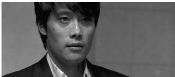
Figure 7.7 Sun-woo (Lee Byung-hun) faces his reflection in the mirror in Kim Ji-woon's A Bittersweet Life (2005)

his own self-image in such a way that allows him masquerade as cold, uncaring — something that the film ultimately reveals, he is not (see Figure 7.7).