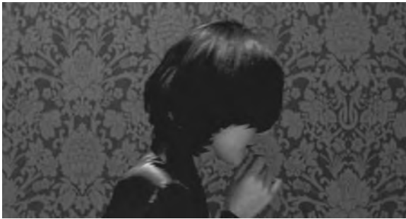
Figure 2.7 Character completes mise-en-scène, A Tale of Two Sisters (Kim Ji-woon, 2003)

Although the Whispering Corridors series and A Tale of Two Sisters are set in public and private spaces respectively, in neither case is the protagonist granted a proper place. If the former break down the boundaries between the public and the private spheres, forcing students to find limited freedom of expression within a public place, in A Tale of Two Sisters , characters are