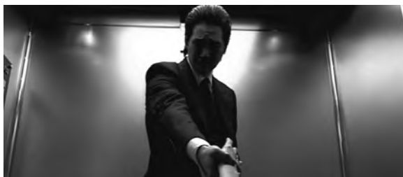
Figure 7.3 Lee (Yoo Ji-tae) hallucinates in the elevator in Park Chan-wook's Oldboy (2003)

It is only after the cathartic completion of this highly perverse equivalent of analysis that the origin of all of this excess can finally find expression. As Lee boards the elevator the film flashes back to the reservoir again. Lee reaches out and grabs onto an arm that appears to reach up from the space in front of him (see Figure 7.3).