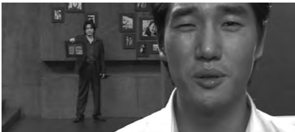
Figure 7.2 Oh and Lee switch positions in Park Chan-wook's Oldboy (2003)

This all changes when Oh remarks that, given the presence of a photo taken at the reservoir, Lee must have been present the day of his sister's suicide. His words transform the photos on the wall from mere decorations and memorabilia to evidence. Suddenly the perspective changes: Oh is no longer shown as reflection, but in medium close-up. Lee, momentarily annoyed, is no longer shown on the left of the screen, but on the right, Oh on the left, and as reflections (i.e., Lee's body is no longer visible in front of the mirror) (see Figure 7.2). Lee then sneers, "This is no fun," regaining narrative authority by describing how he arranged for Oh to be hypnotized and coerced into a sexual relationship with a woman who is, unbeknownst to Oh, his own daughter.