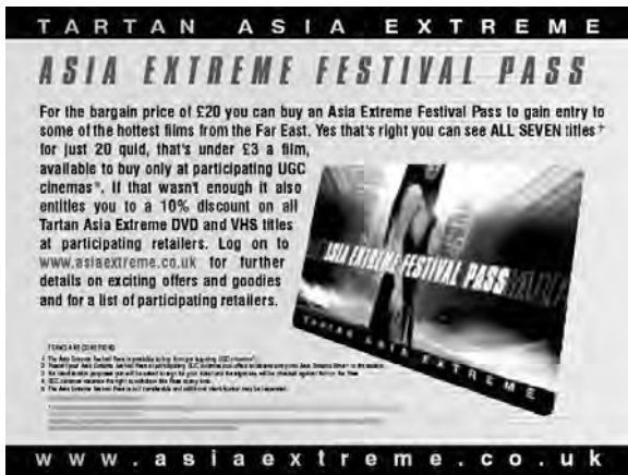
Figure 5.4 The 2003 Asia Extreme festival pass poster

(games console). In line with the roadshows, Tartan also set up competitions with prizes including a trip to Japan and Singapore in 2004 and 2005 respectively. While the roadshows showcased the selection of films that can take the audience to “a world of extreme adventure, extreme horror and extreme thrills,” the competitions provided a chance to go on a real adventure. 13 To win a trip to Singapore, all one needed to do was to visit