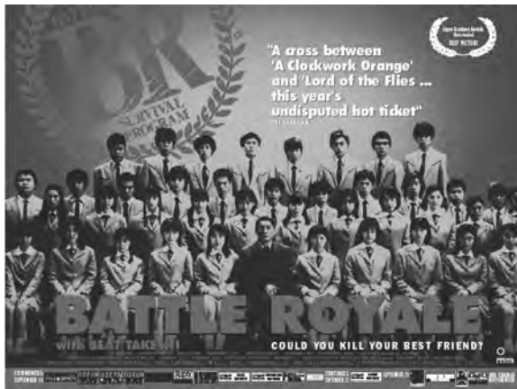
Figure 5.7 Battle Royale poster image

To be sure, some of these titles do include a certain heart-stopping, gruesome scenes. The Isle (Figure 5.8), for instance, contains the infamous fish mutilation scenes, as well as the scenes described by Tony Rayns as “sexual terrorism” where the male protagonist swallows fishhooks and pulls them back, and the female protagonist inserts fishhooks into her vagina. 18 Audition features a man with no feet or tongue kept in a sack and scenes of sadistic