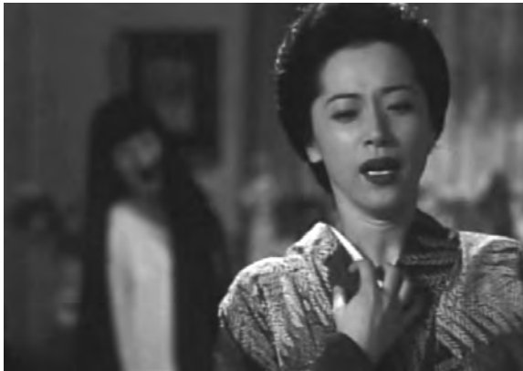
Figure 6.3 Don't Look Up (Nakata Hideo, 1996)