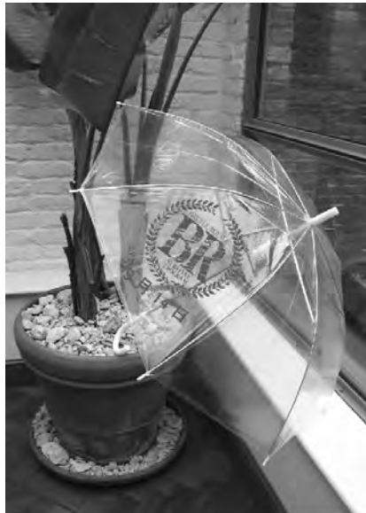
Figure 5.2 Umbrella with the Battle Royale emblem

Following the success of the first roadshow in 2003, Tartan obtained sponsorship from the Singaporean beer brand, Tiger Beer, and the Japanese fashion label, Evisu, for the 2004 roadshow. Maintaining the association with the young and cool, for the 2005 roadshow, Tartan teamed up again with Tiger Beer and Cineworld cinemas as well as their new sponsor Sony PSP