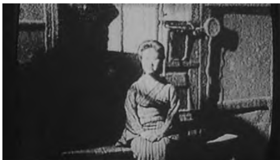
Figure 6.2 Cure (Kurosawa Kiyoshi, 1997)

In this light, the mummy footage aligns itself with another brilliant use of found footage in Kurosawa's career, the recording of the hypnotic treatment of a hysteric woman from the turn of the last century in Cure (see Figure 6.2). In Cure , Detective Takabe (Yakusho Koji) and psychiatrist Sakuma (Ujiki Tsuyoshi) watch a video transfer of the 16 mm footage Sakuma found in his hospital's archive on a home VCR. In the footage, the finger of the invisible hypnotist in the foreground gestures "X." Takabe plays back the video repeatedly for a better view of the gesture; the slow motion of the moving image on the TV screen, à la Jean-Luc Godard in his late films, gets on the viewer's nerves. As we find out, the footage hypnotizes its diegetic viewers, Sakuma and Takabe, into self-destructive and murderous acts. Kurosawa's fake found footage, in Cure and in Loft , operates on manipulation either at the time of filming or at that of viewing in the diegesis, as well as indexicality. While Kurosawa's medium-consciousness and fascination with luminous screens participate in a number of genealogies from Godard to the radiant TV monitor in The Poltergeist (Tobe Hooper, 1982), it most closely intersects with the J-horror discourse.