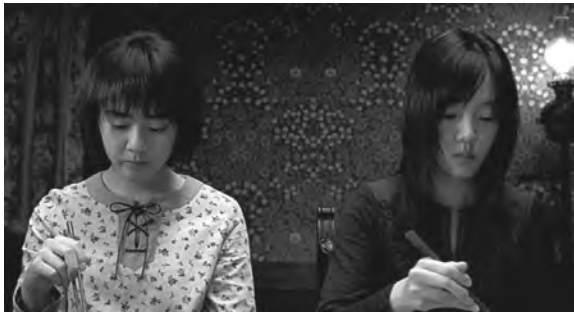
Figure 2.5 Dining scene, A Tale of Two Sisters (Kim Ji-woon, 2003)

If, in the Whispering Corridors series, character interiority is rendered metonymically via personal objects, A Tale of Two Sisters blends characters' actions into the mise-en-scène, transforming them as an object within the externalized interiority. Shallow space, created via the camera's positioning perpendicular to the axis of action, and the lack of strong backlight that often separates figures from background, renders the image quite flat. Consider the first dining sequence in the beginning of the film. After an establishing shot of the family at the dining room table, with the father's back shown, the camera cuts between the stepmother and the two sisters, Su-mi and Su-yeon, both of whom appear to blend into the background (Figure 2.5). When characters are staged in depth, characters often walk in and out of light, which helps the characters to be absorbed into the space and to reduce their prominence from the mise-en-scène. When the stepmother first greets Su-mi and Su-yeon, for instance, she walks from the far background toward the foreground, coming in and out of light. A similar shot is used when Su-mi comes downstairs in the middle of the night to find the television on in the library.