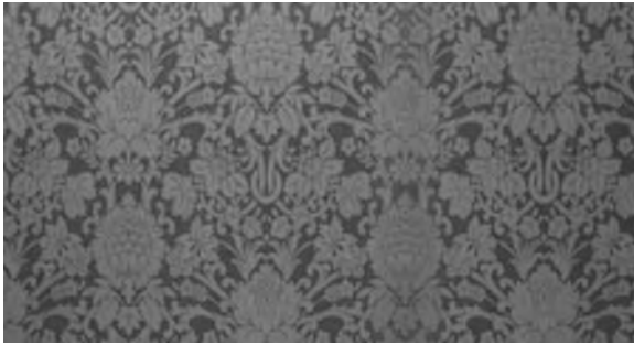
Figure 2.6 Empty moment before stepmother enters, A Tale of Two Sisters (Kim Ji-woon, 2003)

enters the frame, the camera briefly shows only the abstract patterns on the wall, as if it awaits the character's action: stasis is charged with repressed energy (Figures 2.6 and 2.7). Now, the camera cuts to the red closet again, waiting for the stepmother to move into the frame. She paces left and right, punctuated by the empty moment. A similar shot is found when the father comes back home to find Su-mi collapsed in the hallway. He brings medicine for Su-mi, and before he enters the library where he left Su-mi, there is a shot of empty wall, which he slowly enters.