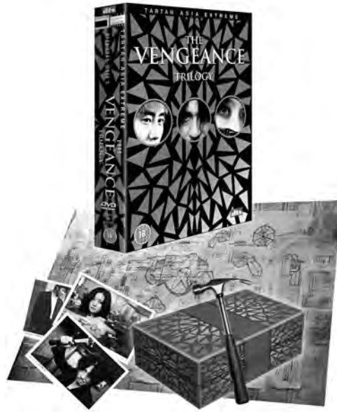
Figure 5.6 Vengeance Trilogy Deluxe Box set