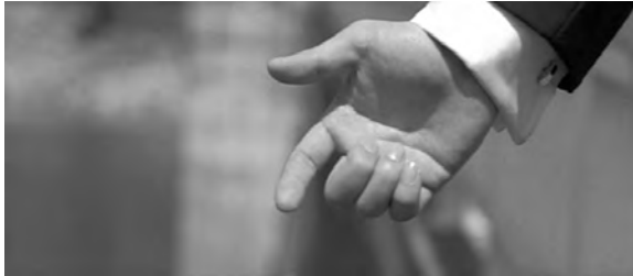
Figure 7.4 Lee's hand/gun. Park Chan-wook, Oldboy (2003).

At once all dualisms collapse — past and present, fantasy and reality come together as the film re-enacts the tragic suicide of Lee's sister at the reservoir. As Lee watches his sister fall into the abyss (he is, at this point, shown alternately as both his younger self and present self), he slowly pulls back his hand, forming the shape of a gun with his index finger (see Figure 7.4).