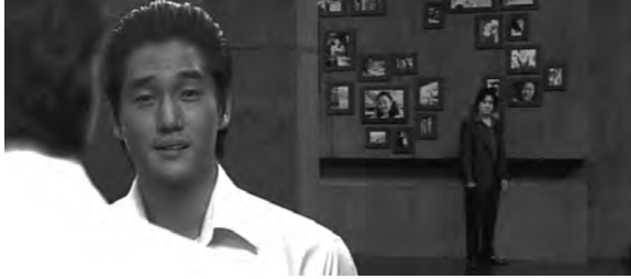
Figure 7.1 Oh Dae-su (Choi Min-sik) confronts Lee Woo-jin (Yoo Ji-tae) in the mirror in Park Chan-wook's Oldboy (2003)

by Lee's clothes, demeanor, and home. In addition, the composition of the shot suggests that Lee (who is visible as both subject and reflection) has reduced Oh (who is visible only in the mirror) to an image — like the photos, a representation, an element of the mise-en-scène (see Figure 7.1).