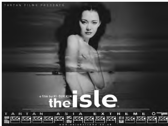
Figure 5.8 The Isle poster image

torture that involves piano wire and acupuncture needles. Famously inducing mass walkouts, if not fainting and vomiting, at several film festivals (notably in Venice [2000] and Rotterdam [2000]), both films had indeed inspired extreme reactions from audiences and critics alike. In his Film Comment article, which is in fact an outright assault on Kim Ki-duk, Tony Rayns argues that the screening of The Isle in Venice was “an archetypal success de scandale,” while speculating about why Venice even chose the film for competition and suggesting that the director is “an instinctive provocateur . . . gleefully malicious in his punishment of audiences.” 19 Similarly, Richard Falcon wrote for Sight and Sound : “ The Isle sees itself as ‘defying genre,’ but, like Takashi Miike’s Audition , it’s a gross-out movie in arthouse clothing. The Isle flaunts its imagery as bold surrealism while making sure it delivers its share of hooks ‘n’ hookers horror and sex.” 20