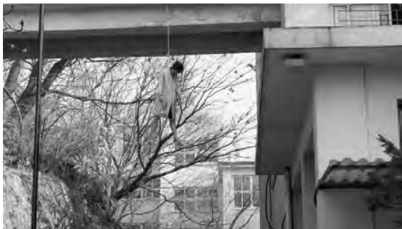
Figure 2.1 Death of Ms Park, Whispering Corridors (Park Ki-hyeong, 1998)