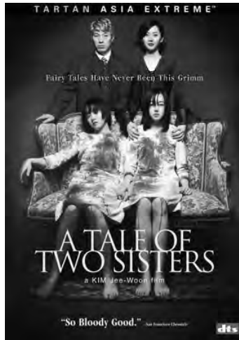
Figure 5.5 A Tale of Two Sisters poster image

Tartan utilized the roadshow when it expanded its territory by launching a U.S. branch in 2004, which, according to McAlpine, “was very, very logical extension” as “there was a whole niche that was being ignored by [distributors] in America.” 14 Tartan USA employed the same marketing campaigns: stand-alone theatrical releases for stronger titles (such as Oldboy ) and a roadshow/cinema tie-in across several major cities in the U.S. Again, Tiger Beer was the main sponsor for the roadshow in the U.S. Initial reactions to the theatrical releases were reportedly lukewarm, but the DVD sales of the Asia Extreme titles started to increase, particularly after the DVD release of the South Korean horror film, A Tale of Two Sisters (Figure 5.5). McAlpine explained that it took a while to persuade video retailers into believing that Asia Extreme “isn’t just some weird niche market . . . but A Tale of Two Sisters changed everything, and now retailers are grabbing [the films] with both hands”.