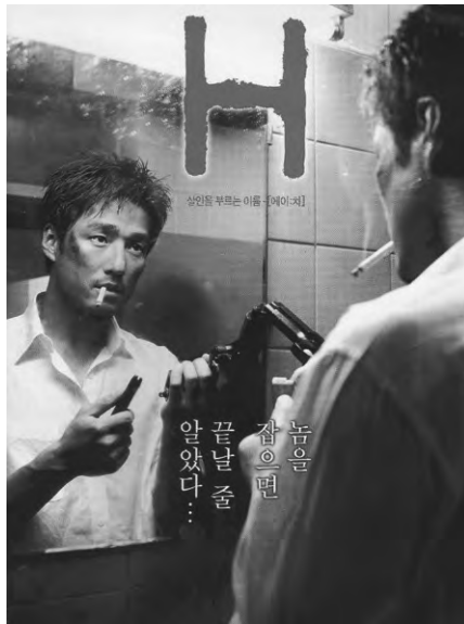
Figure 7.6 Actor Ji Jin-hee as Detective Kang in Lee Jeong-hyeok's H (2002)

The film's use of repetition (the copycat nature of the crimes) and doubling underscores its ostensible debt to the Hollywood thriller. Marketed in the U.S. as " Se7en meets Silence of the Lambs ," the manner in which the film clearly plays with these intertextual references gives an impression of self-aware, self-reflexive critique. In other words, by so obviously playing with Hollywood conventions and references in a film about the investigation of copycat crimes carried out by characters operating in a post-hypnotic trance — carrying out actions scripted by someone else — the film links its own representational strategies with the action of the narrative. Viewed in this light, the film's focus on copycat crimes and hypnotic control both parallels and comments on its status as created under the controlling influence of American culture.