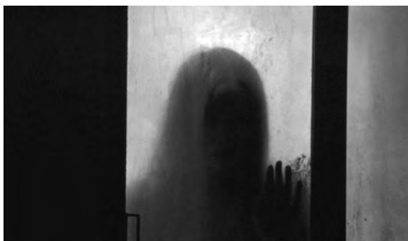
Figure 6.5 Loft (Kurosawa Kiyoshi, 2006)

Moreover, unlike Swimming Pool , I Spit on Your Grave , and What Lies Beneath , the film's narration vacillates between Reiko's perception and Yoshioka's. In Loft , a film obsessed with the acts of seeing and being seen, the introduction of dual perspective has two significant consequences. First, it shatters the film's possibility of belonging to the "fantastic" as Tzvetan Todorov defines it, that is, the genre of fiction where it remains uncertain whether a seemingly supernatural event is what the protagonist imagines or what actually takes place. 41 As Kurosawa himself admits, it is not possible for Reiko to be imagining things like the mummy and Aya's ghost, as it is for Claire in What Lies Beneath . Second, Yoshioka's perspective aligns Reiko with the ghost and the mummy, resulting in a fascinating confusion where it is no longer clear who is the monster. While Aya's appearance in the house is conveyed through Reiko's perception (not necessarily optical POV), Reiko's visit to the Sagami University facility is captured from Yoshioka's perspective from the inside, rendering her exactly like the ghost she is afraid of, as a blurred figure that presses her hand onto the frosted glass window (see Figure 6.5).