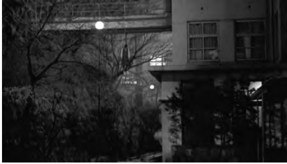
Figure 2.2 Death of Jung-sook, Whispering Corridors (Park Ki-hyeong, 1998)