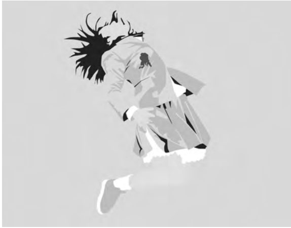
Figure 5.3 Battle Royale T-shirt design