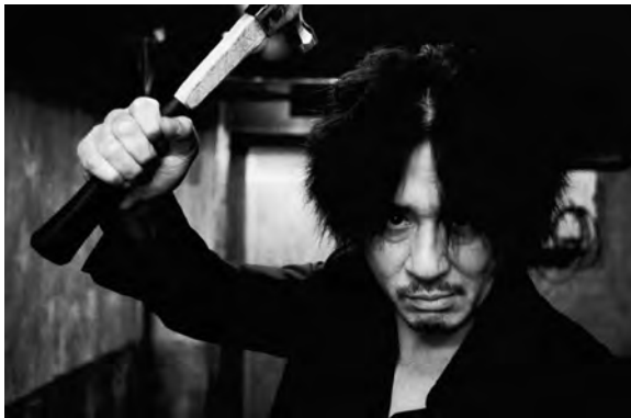
Figure 5.1 Oldboy postcard

The Tartan Asia Extreme label was initially promoted through various “traditional” marketing practices, including radio and television slots, postcards (Figure 5.1), and posters, as well as what the industry calls “teaser campaign” by revealing just enough information about a film (mostly in film and lifestyle magazines) to intrigue potential audiences. Perhaps unsurprisingly for the “extreme” label, what is emphasized and promoted in Tartan’s advertising campaigns is the visceral and hyper-violent nature as well as the shocking and unexpected aspect of the films, as its widely used promotional material declares: “If the weird, the wonderful and the dangerous is your thing, then you really don’t want to miss this chance to take a walk on the wild side”. Similarly, explaining its raison d’être in the introduction to the promotional booklet, The Tartan Guide to Asia Extreme , Mark Pilkington contends that “when Nakata Hideo’s Ring and Miike Takashi’s Audition were unleashed upon unsuspecting audiences nationwide, it became apparent that the appetite for such outrageous fare was massive and it made sense to let people know where to find it.” 11