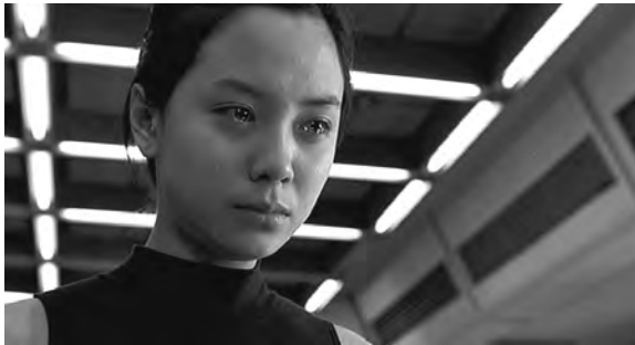
Figure 2.4 Visual punctuation, Wishing Stairs (Yun Jae-yeon, 2003)

The incorporation of the ghost story formula is not unique to Korean horror cinema. However, the Whispering Corridors series successfully encodes the horrific and traumatic high school experiences specific to Korean students by selectively adopting the horror genre icons and conventions. Perhaps some of the reasons that Memento Mori was less successful at the box office than the other installments — even though it was critically acclaimed both at home and abroad — can be found in the film's imbalanced treatment of the elements it incorporates from coming-of-age movies and those of the horror genre. Unlike the first and the last installments, which follow a “whodunit” plot structure, the film foregrounds the emotional trajectory of the two protagonists across the plot. In the beginning of the film, Memento Mori imitates conventional horror film style by providing the viewer with false cues through disjointed camera and figure movements, with the camera constantly passing by Shi-eun, who is practicing on the track. In horror films, such a style often misleads the viewer to suspect the presence of a ghost or a stalker. As the