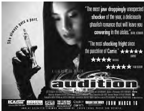
Figure 5.9 Audition poster image

For Audition (Figure 5.9), the Classic-Horror review remarks “Miike’s enigmatic allegory of a self-tormenting soul leaves its bloody imprint on the viewer’s consciousness,” before rating it as “a meditative, melancholic masterpiece that is not for the squeamish.” 24 Writing for the Japan Times , Mark Schilling also praised the film as providing “a jolt of pure, unrefined terror, while reminding us, with skin-crawling starkness, that actions have consequences,” while “most Hollywood films about the dark side are little more than effects-driven melodramas without a practice of conviction behind them.” 25 Another awestruck Internet review titled “Gore Galore” commented that Audition “pushes the gore and grue to a limit rarely seen outside the cheesy cinematic bloodbaths of 1960s schlocksters,” by which of course the reviewer is paying compliments to the film. 26