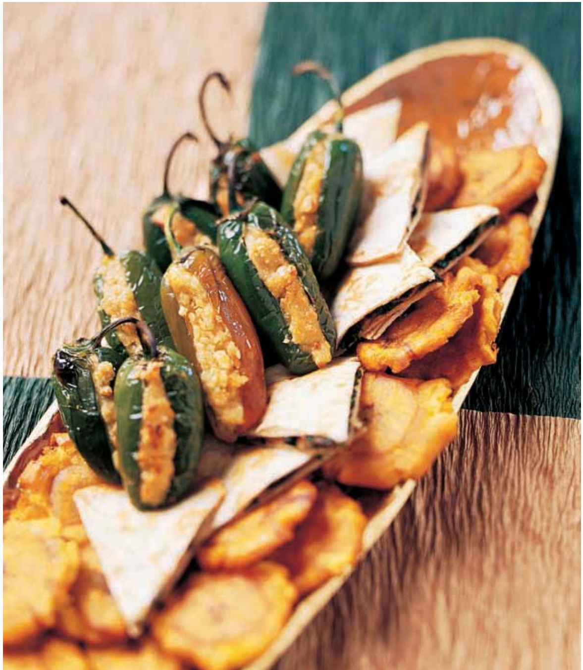
Vegan Chiles Rellenos (page 58), Spinach and Mushroom Quesadillas (page 53), Tostones (page 51).