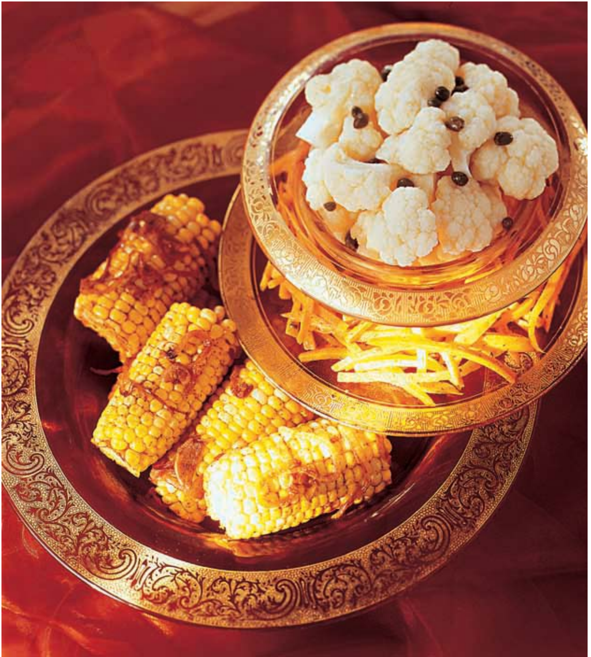
Top right to bottom left: Cauliflower with Capers (page 218), Tunisian Carrot Salad (page 217), Spicy Corn on the Cob (page 219).