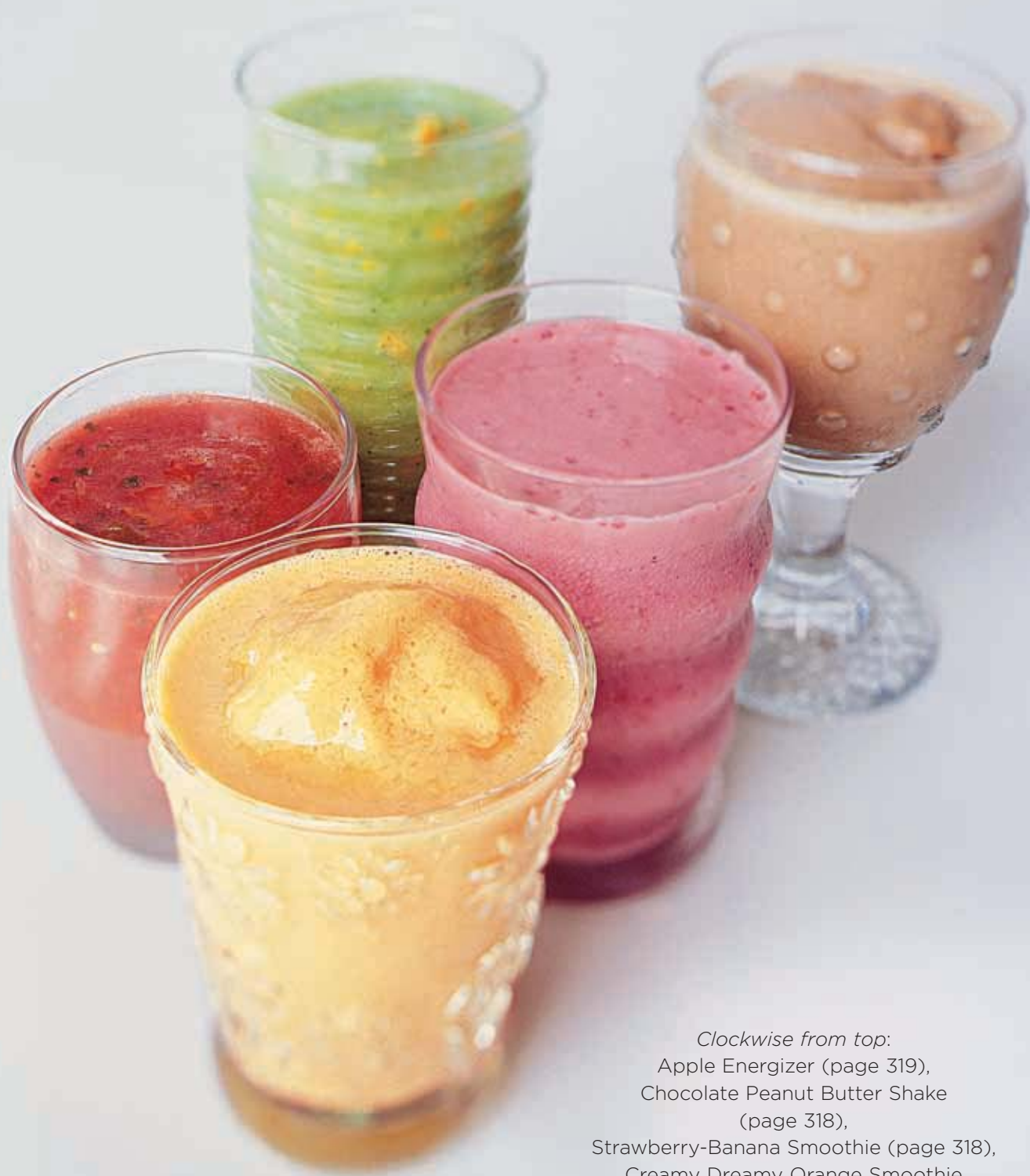
Clockwise from top: Apple Energizer (page 319), Chocolate Peanut Butter Shake (page 318), Strawberry-Banana Smoothie (page 318), Creamy Dreamy Orange Smoothie (page 318), V-5 (page 320).