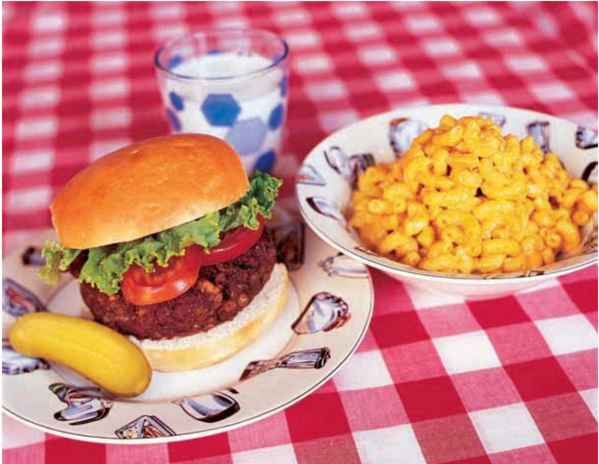
Sun-Dried Tomato and Lentil Burgers (page 155), Macaroni and Cheese (page 193).

Next page, clockwise from top: Corn Chowder (page 81), Spicy Sweet Potato Soup (page 73), Vegetable Soup with Lemon and Dill (page 79).